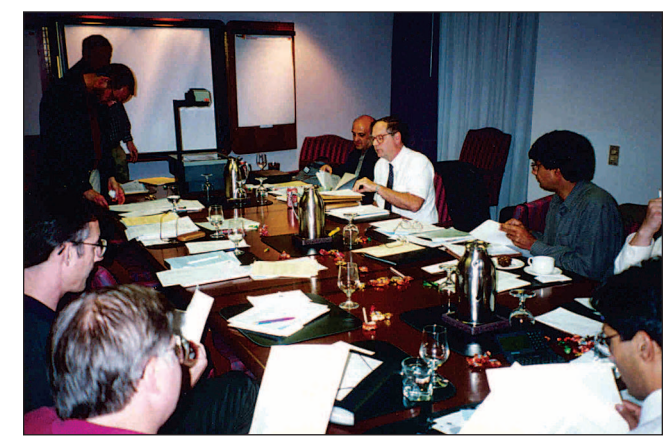
Executive Committee meetings are held four times a year. This meeting was in 1998.