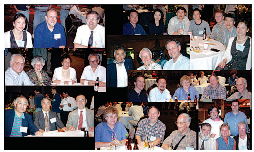
At ACC'97 in Albuquerque, New Mexico, the entertainment was a barbeque and show.

demonstrate the community that has evolved in our field and the genuine bonds of friendship that have been formed. I hope you will enjoy these, as I have enjoyed their assembly.