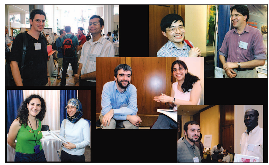
The future of our Society—young members of our community at CDC'03 in Maui, Hawaii.