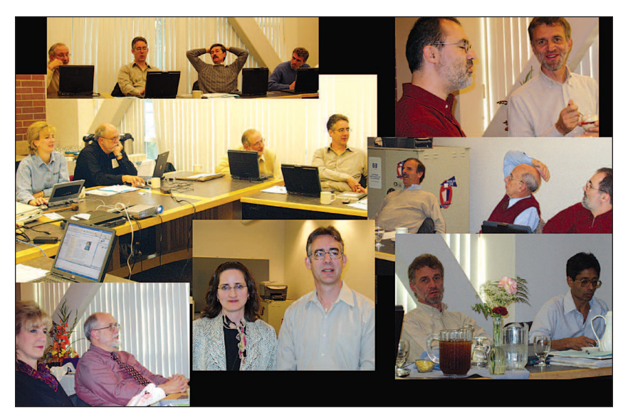
Snapshots from the November 2003 Executive Committee Meeting in Boise, Idaho.