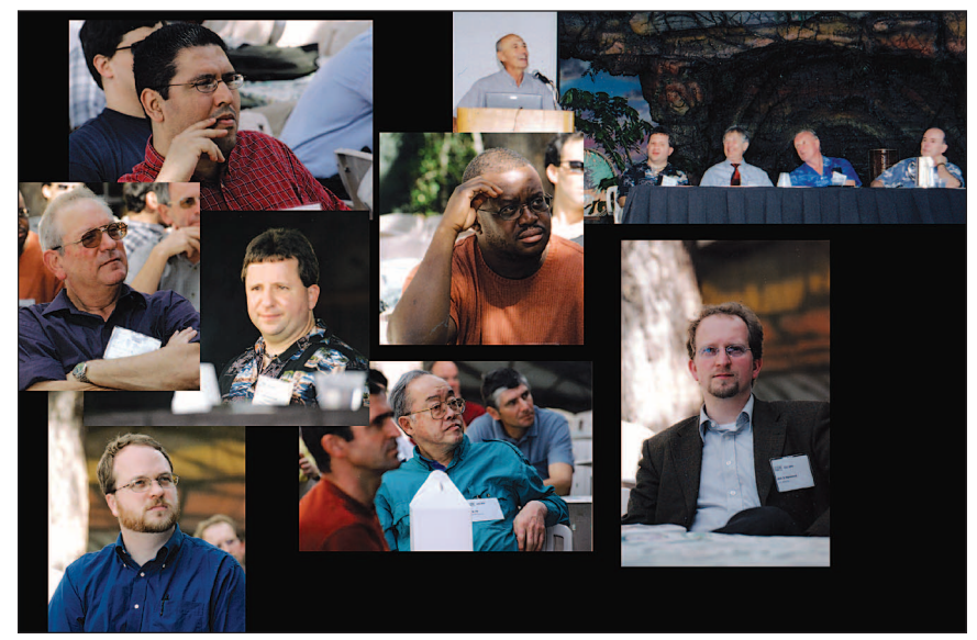
The History panel and attendees at CDC'03 in Maui, Hawaii. Were they pondering the 50th anniversary of our Society?

This photographic history, eclectic or otherwise, provides an archival snapshot of portions of our Society's past, and illustrates the importance of photography's role in preservation. Our past use of photography has been somewhat spotty and relatively poorly preserved. Perhaps this photographic essay can also serve as a reminder to future volunteers and event organizers to ensure that our future is recorded for the benefit of subsequent generations.