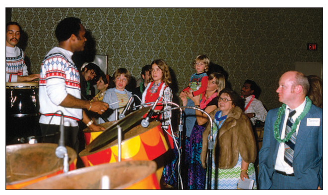
A steel drum band entertains attendees at the closing reception of CDC'76.