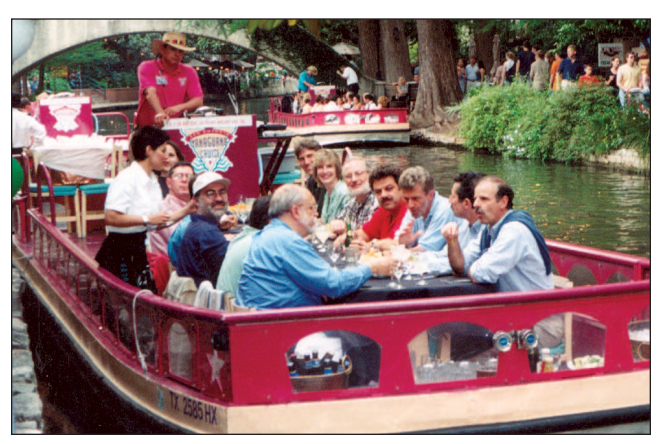
After a long afternoon of policy discussions and decisions, the 2003 Executive Committee enjoys a dinner cruise in San Antonio, Texas.