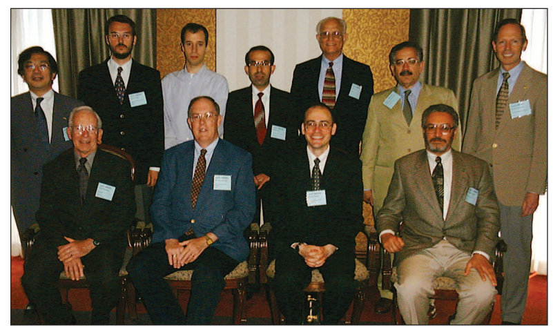
Awards are given at conferences. Here, the ACC'00 awardees.