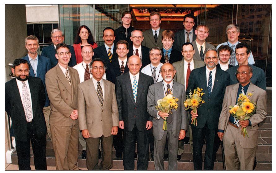
The class of CSS award winners at CDC'00 in Sydney, Australia.