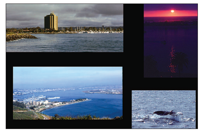
In addition to being a lovely hotel, the Islandia Hyatt—home of CDC'78 in San Diego, California— had wonderful sunsets and vistas that included whales.