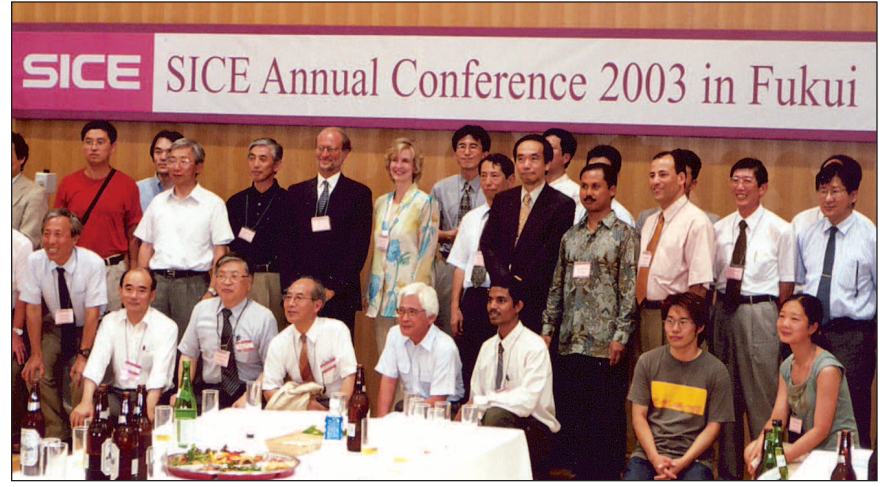
SICE'03 in Fukui, Japan.