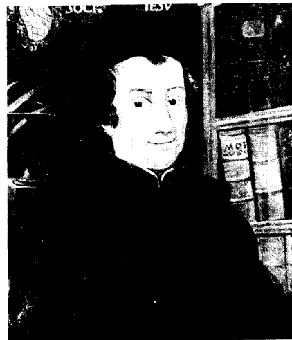
Figure 1. Francesco M. Grimaldi.

In the two parts of his book, Grimaldi presents two possible hypotheses about the nature of light: substance or accident (i.e., a quality of another substance) even if his preferences, as can be deduced from the Preface, are for the second one. However, even if the two parts contain contrasting views about the nature of light, in both Grimaldi opposes the corpuscular theory of light. He is deeply convinced that light is a fluid (a substance or accident of some other fluid substance), and that colors are a modification of it. The phenomenon of diffraction is the main point in favor of this hypothesis.