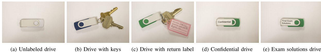
Fig. 1: Drive Appearances —We dropped five different types of drives. We chose two appearances (keys and return label) to motivate altruism and two appearances (confidential and exam solutions) to motivate self-interest, as well as an unlabeled control.