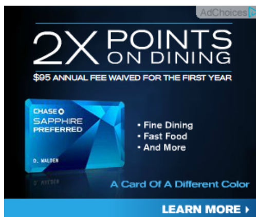
(b) Implemented icon and text [105] (actual size at 115 DPI).

icon’s] communication effectiveness over time”), and that the text “AdChoice” performed worse than alternatives.