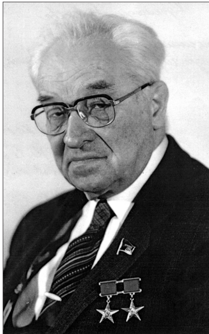
Figure 3. Kotelnikov in later years

army seemed likely to reach Moscow, Kotelnikov's laboratory, together with other scientific establishments, was evacuated to Ufa, around 1000 km to the east. There the laboratory continued to work on secure radio telephony, and by the beginning of 1943 such equipment was being produced on a large scale for the Red Army, having been tested the year before during the battle of Stalingrad. The encryption equipment was later used during negotiations at the Tehran, Yalta, and Potsdam Conferences.