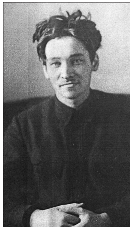
Figure 1. Kotelnikov as a young man.

At the present time no technique along these lines permits, even theoretically, the capacity of the "airwaves" or a cable to be increased any further than that corresponding to "single side-band" transmission. So the question arises: is it possible, in general, to do this? Or will all attempts be tantamount to efforts to build a perpetual motion machine?